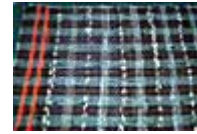
rag rug throw rug, hand crafted hand woven rug