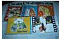
wholesale greeting cards resell 4 $ huge lot