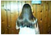
The famous hair cut~I'll cut my hair if you let me dvd